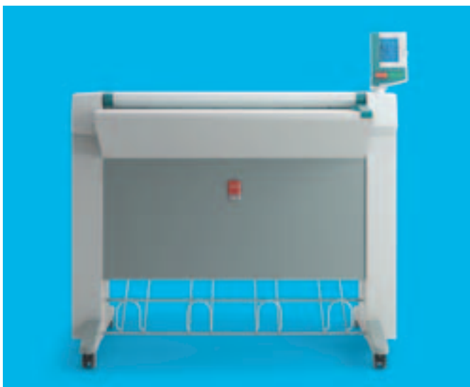
Océ TC4 (for original thickness up to .12 in. or 3 mm)