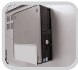
Integrated Xerox FreeFlow Accxes Print Server.