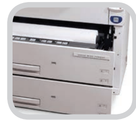
Holds up to four rolls for uninterrupted printing and media flexibility.