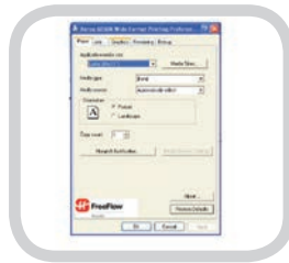
Familiar Xerox FreeFlow Accxes print driver enables a fast learning curve.