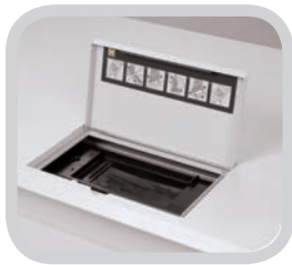
Easy to add toner.