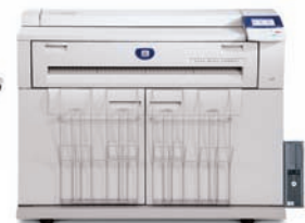
Digital Copier/Printer with the Wide Format Scan System