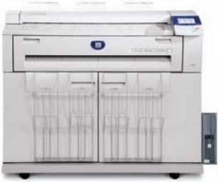
Digital Copier/Printer with Scan-to-Net